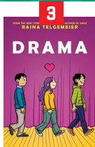
3 Drama by Raina Telgemeier REASON: LGBT content