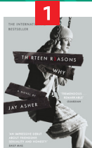
1 Thirteen Reasons Why by Jay Asher REASON: suicide

The American Library Association tracked 354 challenges to library, school and university materials and services in 2017. Of the 416 books that were challenged or banned in 2017, here are the top 10 most challenged: