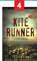
4 The Kite Runner by Khaled Hosseini REASONS: sexual violence, religious themes, "may lead to terrorism"