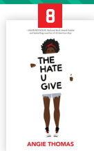
8 The Hate U Give by Angie Thomas REASONS: drug use, profanity, "pervasively vulgar"