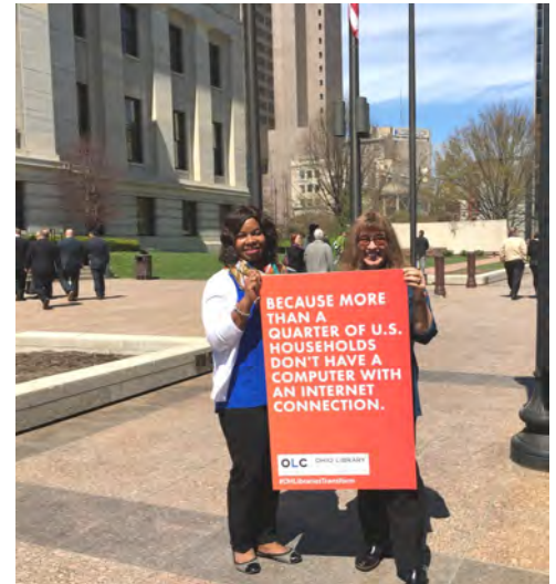
Library professionals from across the state will gather at the Ohio Statehouse on Wed., March 29 for OLC's Legislative Day.

This year, Legislative Day will include a luncheon for attendees and legislators, a special awards ceremony and featured speakers. The registration fee is $40 and includes the luncheon. Please register by March 23, 2017. Learn more at olc.org/advocacy-and-government-relations/ .